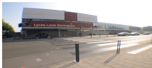
Lycée Louis Blaringhem